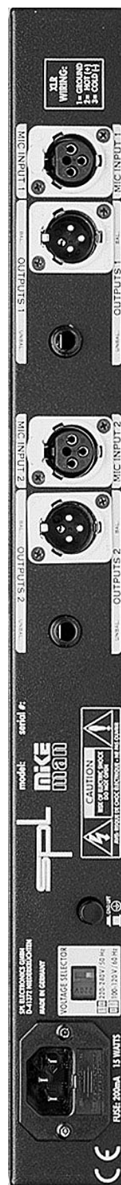
Rearfront MIKEMAN, Model 9523

Both output stages operate in parallel, so it is possible to connect two different destination units simultaneously, for example to record to two different media at the same time or split the output between a mixer and effects processor.